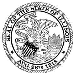
Great Seal of the State of Illinois (1868-present)

The first seal used in what is now Illinois was that of the Northwest Territory in 1788. The Seal of the Illinois Territory followed in 1809.