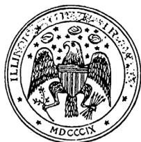
Seal of the Illinois Territory (sketch) (circa 1809-1819)

The Secretary of State is the keeper of the Great Seal of the State of Illinois. Reproduction or use of the state seal or the state flag is permissible only in strict accordance with Chapter 5 of the Illinois Compiled Statutes .